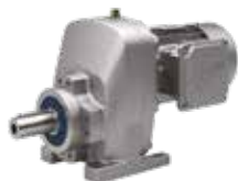
Footed housing with B14 flange and integral motor