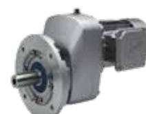
Housing with B5 flange mounting and integral motor