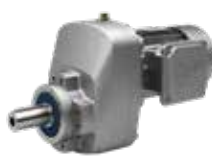
Housing with B14 flange mount and integral motor