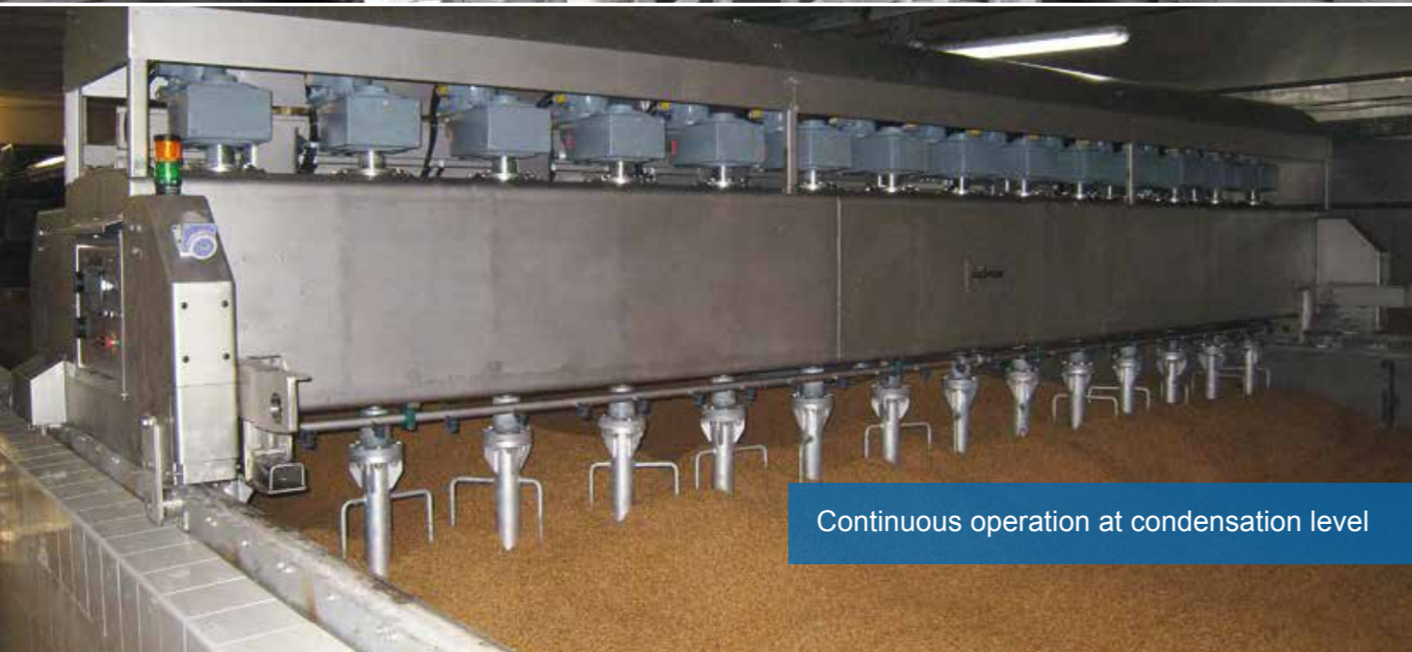
Continuous operation at condensation level