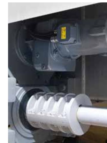
Travelling drive. – The UNICASE™ parallel shaft gear unit with helical gear first stage moves the turning machine over the saladin vat.

Thanks to a high reduction ratio in the gear units, the 8 turning machines travel on rails across the 174 foot long and 6.5 feet deep Saladin boxes at a moderate speed. NORDAC PRO SK 500E series frequency inverters control the speed changes of the motors during the various phases of the malting process.