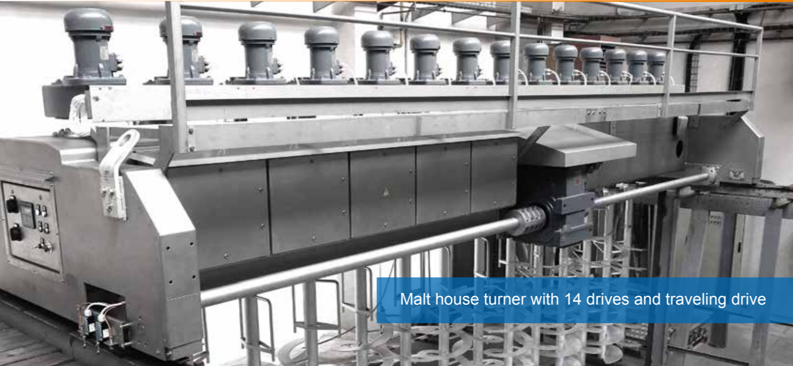
Malt house turner with 14 drives and traveling drive