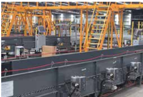
BCS solution for Toll IPEC facility Melbourne

NORD DRIVESYSTEMS – A facility of this size requires an extensive conveyor system to move parcels around within the facility. Such a system requires a significant quantity of motors and variable frequency drives. BCS chose NORD's new helical bevel series geared motors fitted with decentralized variable frequency drives for the job. "The conveyors run the delivery of all parcels to the sorter and basic distribution from the sorter as well", explained Frank Kassai, Group Engineering Manager at BCS. "We were looking at over one thousand motors and drives. They're all different sizes and range [from] 0.5 HP (0.37 kW) to 7.5 HP (5.5 kW)."